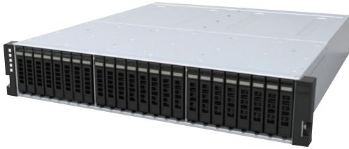
2U24 Flash Storage Platform