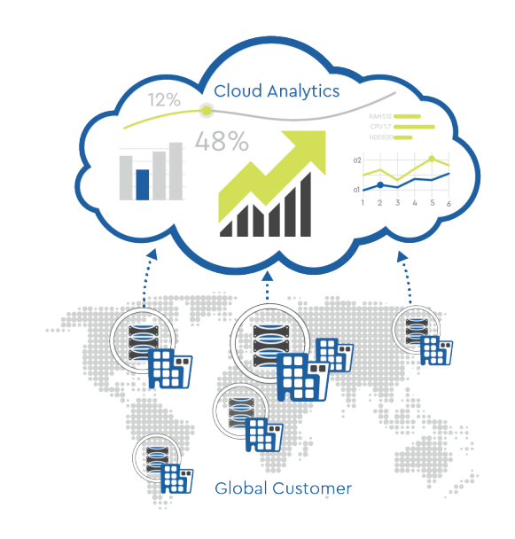
Figure 2. IntelliCare cloud-based analytics

Powered by cloud-based analytics and backed by a team of storage experts, IntelliCare enables you to quickly and easily monitor the health, performance, and usage of all your IntelliFlash Arrays; predict future requirements; and detect problems before they develop into serious issues.